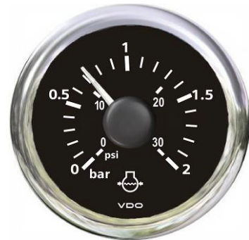
Picture: Mechanical Water Pressure Gauge

Gauge to indicate cooling-water pressure.